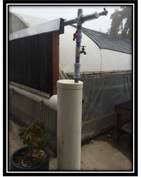
New water return and pump